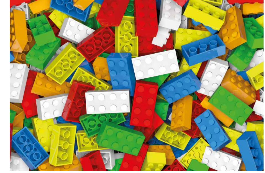
The introduction of this system would harm third parties, since the period of legal uncertainty would be extended. Many years could pass between the filing date and the date of grant and third parties wouldn't know the exact scope of protection of a

There are also disadvantages tied to deferred examination, since it would stretch the duration of prosecution of a patent application which, in the view of many applicants, is already too long.